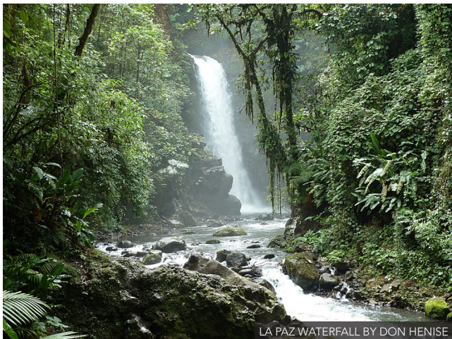
LA PAZ WATERFALL BY DON HENISE

Upon arrival, after clearing customs and immigrations at the airport, meet your driver and transfer to Hotel Balmoral, situated in the heart of the city near the Gold Museum and the National Theater, along the city's famous pedestrian boulevard. This evening enjoy a welcome dinner and program orientation at El Patio featuring a variety of options including a full service restaurant, pizzeria, coffee shop, bar and wine cellar. In order to arrive in time for orientation, participants must book flights that arrive in San José no later than 4:30 pm. Overnight at Hotel Balmoral. (D)