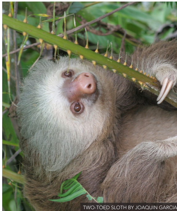
TWO-TOED SLOTH BY JOAQUIN GARCIA

This morning after breakfast, depart for Arenal Hanging Bridges, a reserve that abounds with wonderful trails, suspension bridges, and outstanding natural areas.