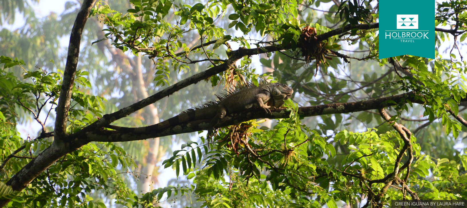
GREEN IGUANA