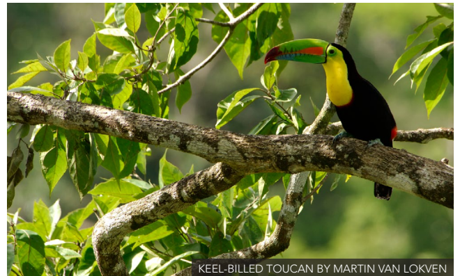
KEEL-BILLED TOUCAN