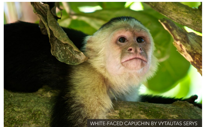
WHITE-FACED CAPUCHIN BY VYTAUTAS SERYS