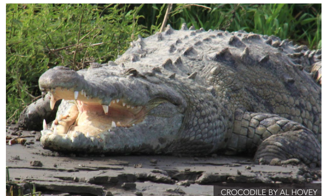
CROCODILE BY AL HOVEY